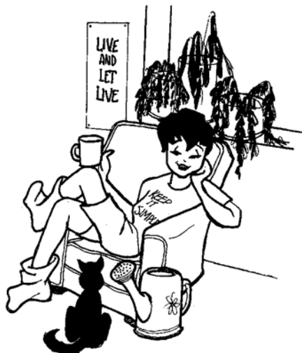
My sponsor says the good thing about procrastination is that you always have something planned for tomorrow.