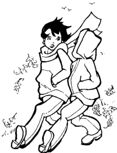
"I don't want to trudge the Road of Happy Destiny - I want to sprint it."

Night Owl Tidbit: Do you have an interesting Night Owl story you want to share? Send an e-mail to nightowl@aastpaul.org .