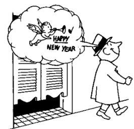
Victor E. cartoon