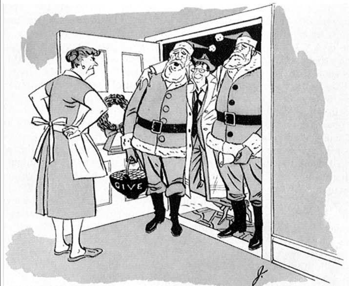
“You the party that wanted her old man home for Christmas?”