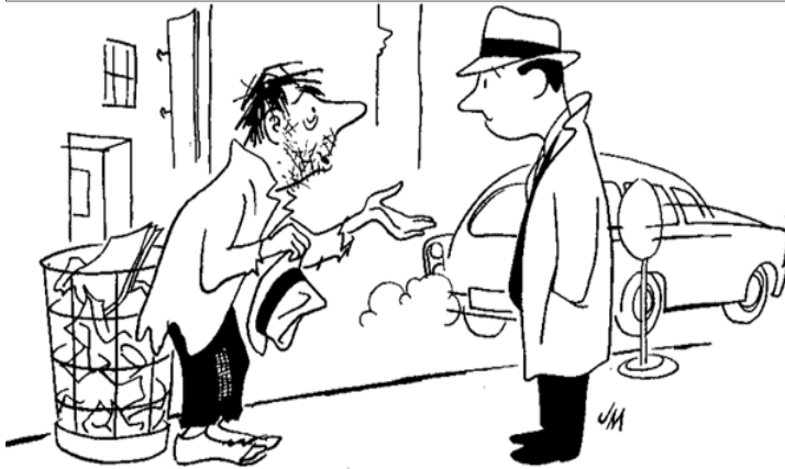
"Brother, can you spare a dime for a candy bar--to alleviate my craving for alcohol?"